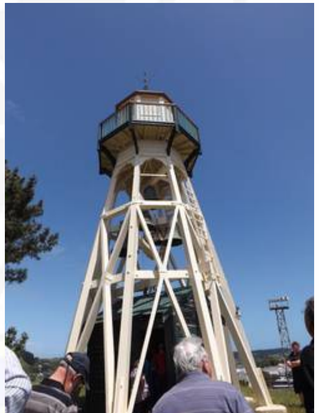
Cooks Gardens Bell Tower 2014_DSCF2012