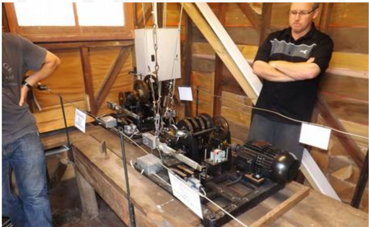
Cooks Gardens Bell Tower Chime Mechanism