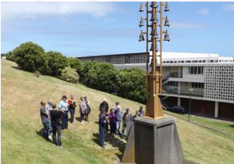
Members gather around the Carillon in Queen's Park