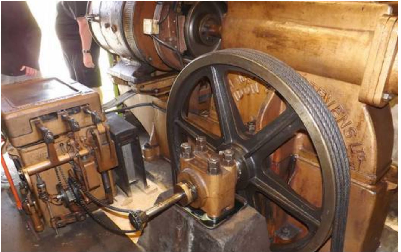
Durie Hill Elevator Mechanism