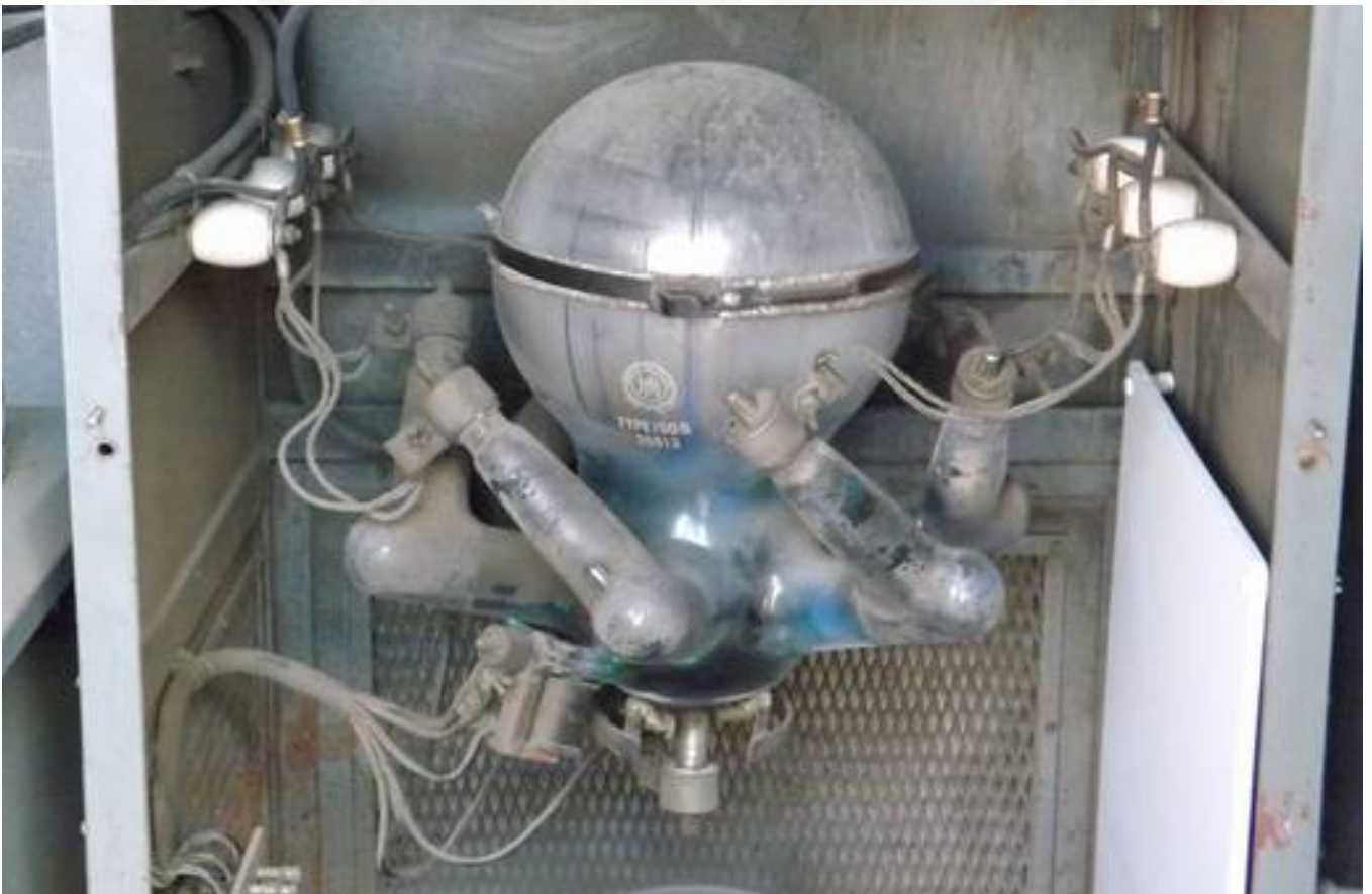
Durie Hill Elevator Mercury Arc Rectifier