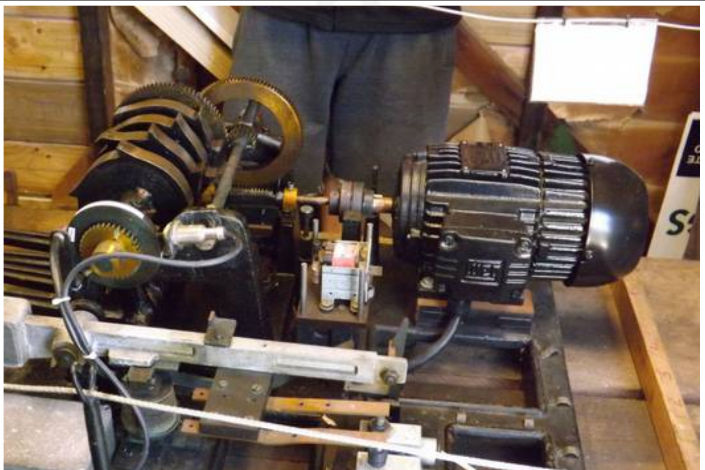
Close up of part of the Cooks Gardens Bell Tower Chime Mechanism